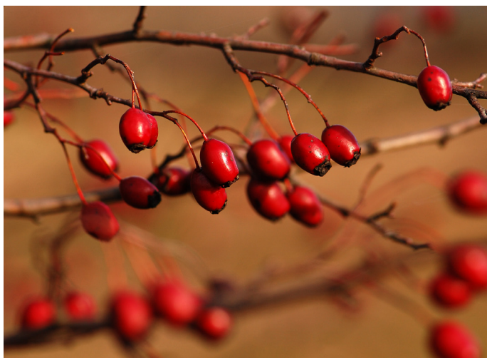
Enovrati glog ( Crataegus monogyna )

Contributions concerning the nature protection and conservation were published monthly on the local TV station (TV Oron) The project and work within it was also presented in several talk shows on the local TV station. The advertisement for buying agricultural land in the area of Lake Cerknica was also regularly transmitted.