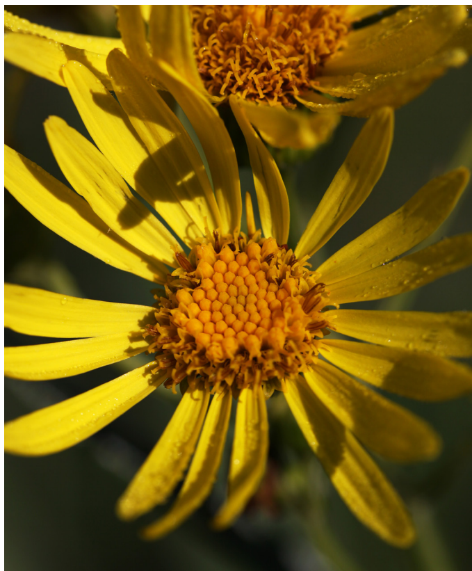
Močvirski grint ( Senecio paludosus )

V Akcijskem planu renaturacije vodotokov Cerkniškega jezera smo strnili ideje, študije in načrte o posegih na jezeru ter podrobneje opisali dejansko izvedene posege, katerih posledica je spremenjen vodni režim jezera. Vključili smo celotni opis izvedbenih del ter časovni in finančni plan renaturacije vseh nekdanjih izravnanih vodotokov na Cerkniškem Jezeru.