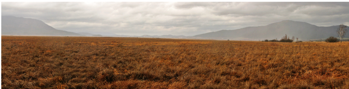
Dujce (The Dujce fen)

The project a steering committee made up of representatives of the project team, local communities and project partners was established. The steering committee met at regular annual meetings at which council members assessed the progress of the project in terms of project activities.