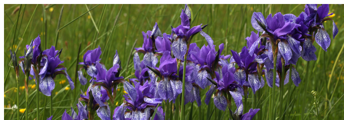
Sibirske perunike ( Iris sibirica )