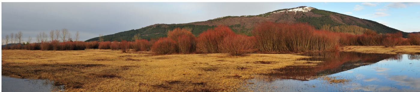
Območje mulčanja na Retju (Retje – mulching area)