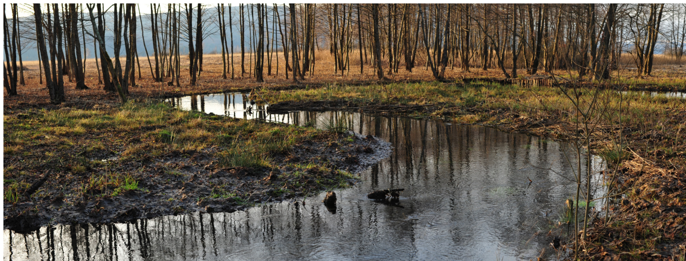
Obnovljeni meandri Goriškega Brežička (Restored meanders of Goriški Brežiček stream)

Low carrying capacity of the marshy soil makes mechanized clearing of the central part of the fen impossible. For this reason the public action that was met with great response was organized. The participants have cleared away 1,5 hectares of the overgrown fen. In collaboration with enterprise Komunala Cerknica d.o.o. we continued to work in the winter months and in the year of 2009 all of the unwanted woody coppice was removed from the Dujce fen.