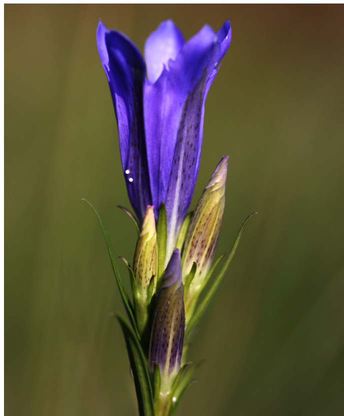
Močvirski svišč ( Gentiana pneumonanthe )

Meadows are being overgrown with coppice on account of abandoning the traditional land use. This threatens the existence of these habitats and thus the existence of species that depend on them. That is why regular mowing is of vital importance in protecting these habitats and their inhabitants. Since wet meadows purchased by Notranjska Regional Park are meant for long-term protection our approach to their management is nature-friendly. The mowing method we use is best suited to birds that live on these meadows. These meadows host many bird species, some of them recognized as threatened in Europe.