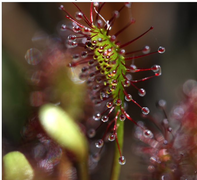
Srednja rosika ( Drosera intermedia )

Tekom projekta smo redno sodelovali z lokalnima radijskima postajama (Radio 94 in NTR), na katerih smo poročali o projektih aktivnostih ter prebivalce seznanjali s pomenom narave in njenega varstva. Sodelovali smo tudi v radijski oddaji za mlade - Rompompom. Na lokalni televizijski postaji (TV Oron) smo večkrat sodelovali v pogovornih oddajah in mesečno objavljali prispevke v zvezi z varstvom narave. Redno smo oddajali oglas za nakup kmetijskih zemljišč na poplavnem območju Cerkniškega jezera. V času trajanja projekta je bilo na lokalnih in nacionalnih televizijskih in radijskih postajah skupno objavljenih 117 prispevkov v zvezi s projektom.