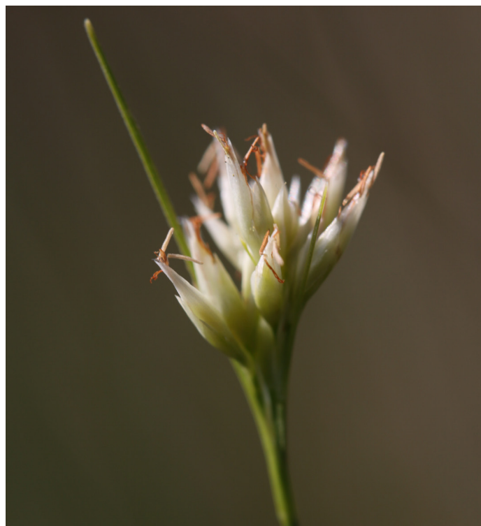
Bela kljunka (Rhynchospora alba)

171 plant species that thrive in the area of Lake Cerknica and its surroundings and are characteristic, endangered or interesting in any other way are presented in this pocket-sized guide. It enables visitors of Lake Cerknica to get to know the plant species and learn about rich diversity of the area. Goals of the LIFE project and activities within which contributed to conservation of nature in the area are also included. Booklet was printed in 10000 copies and is available to all households in the Municipality of Cerknica, local schools and libraries free of charge.