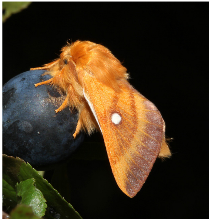
Hromi volnoritec ( Eriogaster catax )

Leta 2006 je Notranjski regijski park pridobil finančna sredstva iz programa LIFE – Narava za projekt LIFE 06 NAT/SLO/000069 »Presihajoče Cerknjsko jezero«, ki sofinancira naravovarstvene projekte na območjih Natura 2000. Namen projekta je bil na Cerknjskem jezeru zagotoviti ugodne pogoje za zaščito in ohranitev ogroženih živalskih in rastlinskih vrst ter njihovih habitatov. Dejavniki, ki ogrožajo biotsko pestrost na projektne območju so predvsem spremenjene struge vodotokov, opuščanje košnje in pomanjkljivo poznavanje narave. Da bi te grožnje odpravili, smo v okviru projekta izvajali različne naravovarstvene akcije, s katerimi smo skušali zagotoviti ugodne pogoje za uspešno gnezditve ogroženih vrst ptic, življenje dvoživk, metuljev in drugih živali ter uspevanje ogroženih rastlinskih združb. S projektom smo želeli spodbuditi ponoven stik ljudi z naravo, domačinom približati pomen biotske pestrosti in jih tudi vključiti v proces varstva narave na tem območju.