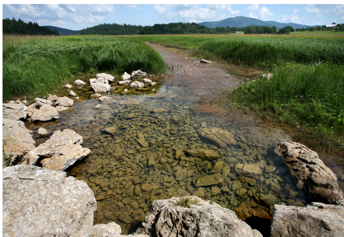
Izvir Otoškega Obrha (The source of Otoški Obrh stream)

V času trajanja projekta je izšlo 6 biltenov z naslovom Novice Notranjskega regijskega parka, ki so jih prejela vsa gospodinjstva v občini Cerknica, lokalna knjižnica, šole in vrtce naravovarstvene mreže šol in vrtcev, člani projektne sveta, pa tudi udeleženci predavanj in razstav. V biltenih smo opisno in slikovno predstavili rastlinstvo in živalstvo Cerkniškega jezera, posamezne naravovarstvene aktivnosti v sklopu projekta LIFE ter naravno in kulturno dediščino Notranjskega regijskega parka.