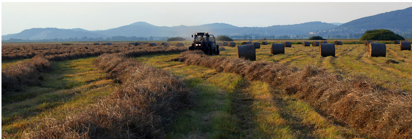
Pozno poletna košnja (Late-summer mowing)

Project LIFE 06/NAT/SI/000069 »Intermittent Lake Cerknica« has undoubtedly contributed to better reception and understanding of the Natura 2000 network not only on local but on global level as well.