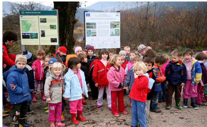
Najmlajši obiskovalci jezera (The youngest visitors)

This game is yet another way to present the animal and plant life of the area to the people. It is meant for children in the first place, but it can entertain and teach adults as well. The game is comprised of cards with pictures of threatened animal species that live in the area of Notranjska Regional Park and are protected under European laws.