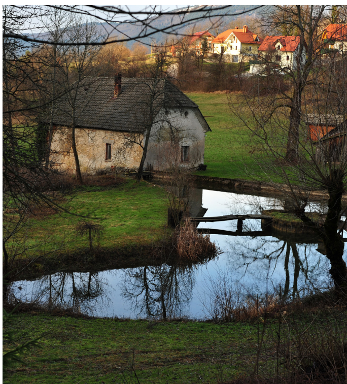
Izvir Goriškega Brežička (Source of Goriški Brežiček stream)

In the Action Plan for renaturation of watercourses in Lake Cerknica our ideas, studies and plans of the interventions in the lake have been resumed and the actual implemented interventions resulting in a modified water regime of the lake have been described in detail. A complete description of implementation of works and a frame time and financial plan of renaturation of watercourses in the Lake Cerknica are also included.