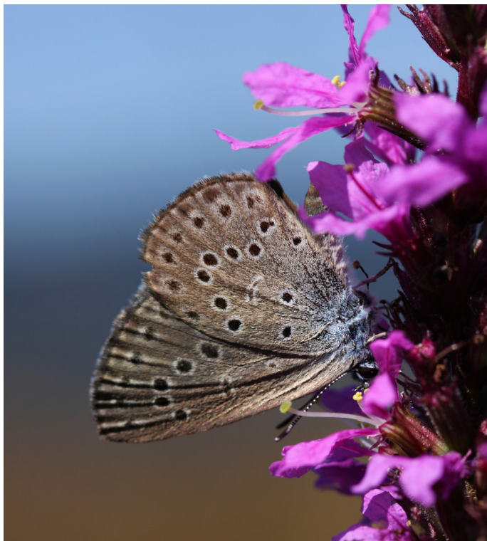
Sviščev mravljiščar ( Maculinea alcon )

Renaturacije nekdanje struge potoka Tresenec od njegovega izvira proti požiralnikom Levišča smo se lotili z namenom dvigniti nivo talne vode in na ta način omogočiti primerne razmere za uspevanje značilnih vodnih in obrežnih rastlinskih združb. Tresenec je izjemnega pomena tudi za živalski svet, saj je edini vodotok na Cerkniskem jezeru, ki se nikoli ne presuši in tako v času suše predstavlja zatočišče vodnim živalim. Tudi zato lahko ob Tresencu še opazimo sledi vidre ( Lutra lutra ). Podjetje GRADBINKO d.o.o. je obnovilo staro strugo v dolžini 650 m.